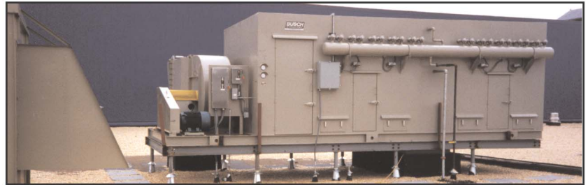
Collection of weldsmoke fume using WE-30 unit.