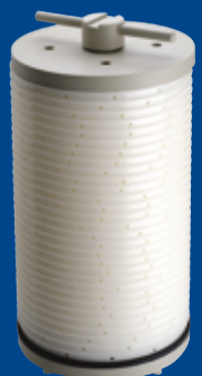
Disc filter assembly