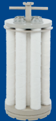
Cartridge filter assembly