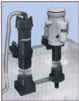
Small Infiltrator system constructed of CPVC, mounted inside tank.