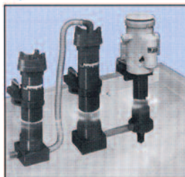
Add a carbon chamber to your existing filter system.

Dye contaminants from nickel acetate sealing solutions and crack detection liquids as well as taste, color, or odors can also be removed.