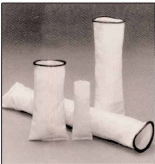
High-strength reusable bag filters